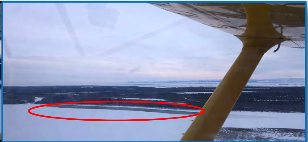
Numerous open holes below Akiak